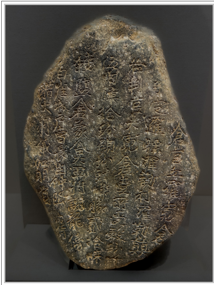
Illustration 1: The 'Storehouse Tablet' at the Dàlǐ Prefecture Museum

The text is carved on a local gneiss stone, uncut and unpolished, about 57cm high and 40cm wide at the widest point. The stone is currently exhibited at the Dàlǐ Prefecture Museum 大理州博物馆 in Dàlǐ City 大理市, see illustration 1.